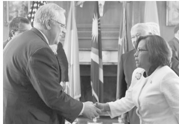
INTERIOR CHIEF: U.S. Department of the Interior Secretary David Bernhardt welcomes Marshall Islands President Hilda Heine to the Interior Department in Washington, D.C., on May 20.

The secretary of the U.S. Department of the Interior has endorsed passage of Del. Michael San Nicolas' war claims correction bill.