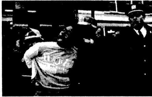
The NYPD is under fire for some of its practices.

The NYPD "is the most regulated department in the entire city," Bloomberg said on Wednesday. "I think we've got