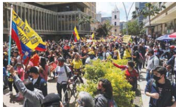
BOGOTA: Demonstrators take part in a protest demanding government action to tackle poverty, police violence and inequalities in health care and education systems, in Bogotá, Colombia, on Wednesday.

The protests have been marked by violence by both police and civilians. The attorney general's office