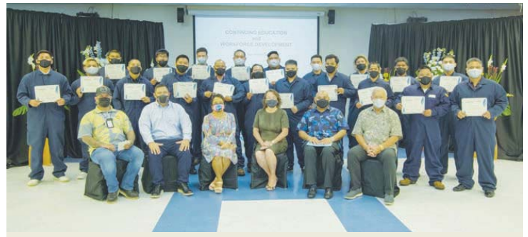
BUILDING THE ISLAND: The Guam Community College Future Builders of Guam Construction Boot Camp held a ceremony at the schools Multi-purpose Auditorium Monday morning. A total of 21 students completed the camp.

Participants in the program earn nationally recognized certifications